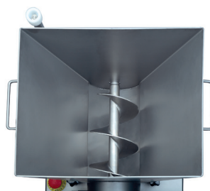
▷ Detail hopper view